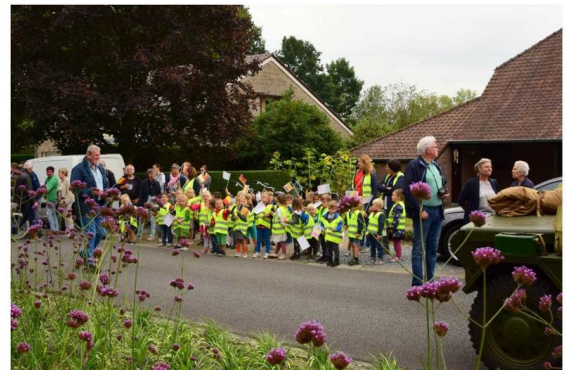
page 10 of 12