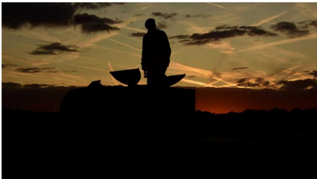
20240828 LTF XXX Corps Overview All Movements September 14-20 Rev 1.3 NL

Rivierpark Nijmegen Waal (Island Veur-Lent) 6663 Nijmegen Klein Amerika 6, 6562 KC Groesbeek