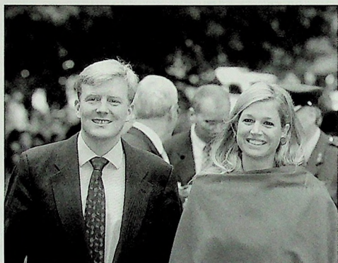
Wednesday 19 September 2001. Willem-Alexander and Máxima arrive at the Airborne Museum.