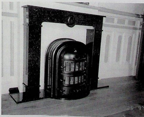
A beautiful, recently fitted antique stove enhances the Airborne Museum's refreshment room.