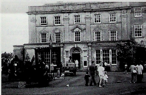
Fulbeck Hall in Lincolnshire, 1st British Airborne Division headquarters in 1944, photographed during 'The Forties' weekend held on 15 and 16 July 1995.

Admission is free for 'Heemkunde' members and 5 guilders for non-members.