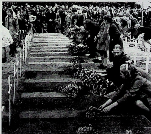
25 September 1945. Schoolchildren lay flowers on the graves at the Airborne Cemetery, Oosterbeek.