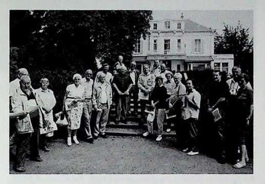
A small group of "excursionists" poses at the rear of the Airborne Museum.

The British artist David Shepherd has given the Airborne Museum permission to issue reproductions of his paintings, "Arnhem Bridge 5pm The Second Day" and "Oosterbeek Cross Roads - 22 September 1944", on a once only basis. These reproductions are available at the museum and cost 12,50 guilders each.