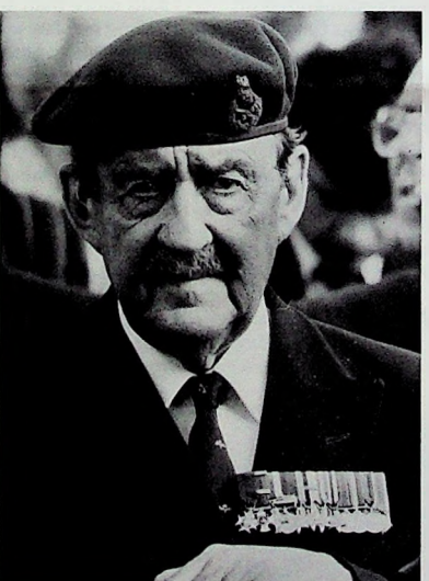
Major-General John Frost during the commemoration of 1989.