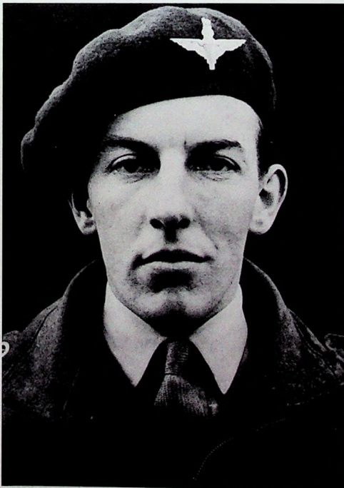
Major Digby Tatham-Warter in 1944.

For his conduct during and after the Battle of Arnhem he received a top British decoration, the Distinguished Service Order.