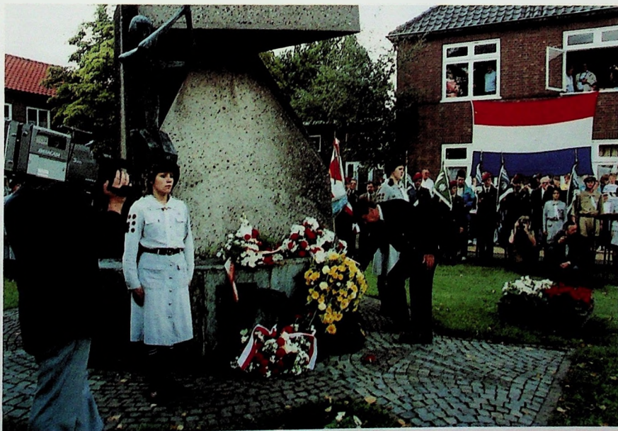
Zaterdag 16 september. Generaal Frost legt een krans bij het monument voor de Eerste Onafhankelijke Poolse Parachutisten Brigade in Driel.