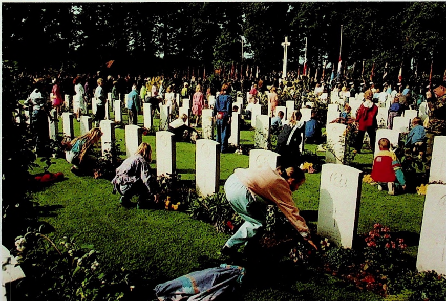
Schoolkinderen leggen tijdens de herdenkingsdienst bloemen op de graven van de gesneuvelden. Schoolchildren laying flowers on the graves.