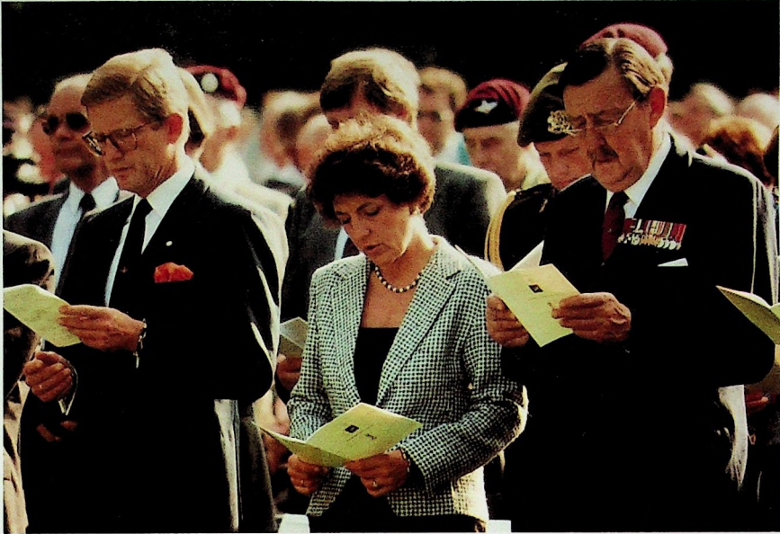
Zondag 17 september. Als speciale gasten waren dit jaar op de Airborne Begraafplaats aanwezig HKH Prinses Margriet en haar echtgenoot de heer Pieter van Vollenhoven. Rechts: Generaal Frost, leider van de Pilgrimage. Sunday 17 September. Special guests at the Airborne Cemetery this year were HRH Princess Margriet and her husband Mr. Pieter van Vollenhoven. On the right: Major-General Frost, the leader of the Pilgrimage.