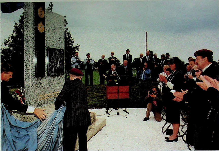
Vrijdag 15 september. Onthulling van het monument voor de Royal Engineers en de Royal Canadian Engineers op de Rijndijk in Driel.

Friday 15 September. Unveiling of the monument for the Royal Engineers and the Royal Canadian Engineers on the Rhine dyke at Driel.