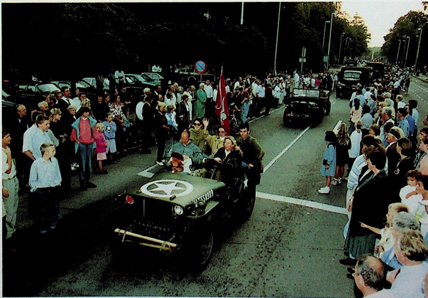
Zondag 17 september. Oude legervoertuigen van de vereniging "Keep Them Rolling" rijden in een lange kolonne Oosterbeek binnen.

Friday 15 September. Unveiling of the monument for the Royal Engineers and the Royal Canadian Engineers on the Rhine dyke at Driel.