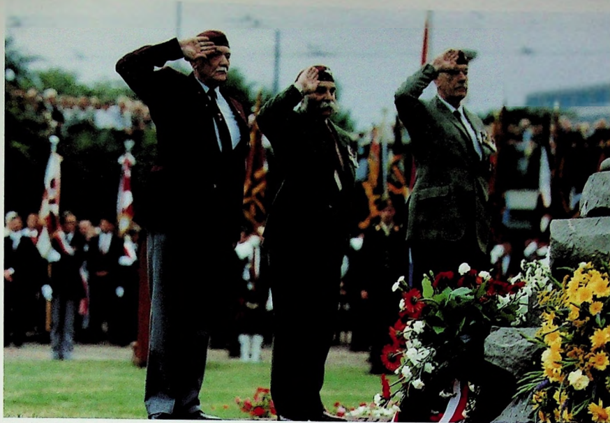
Zaterdag 16 september. Drie veteranen salueren nadat zij een krans hebben gelegd bij het monument bij de Rijnbrug in Arnhem.