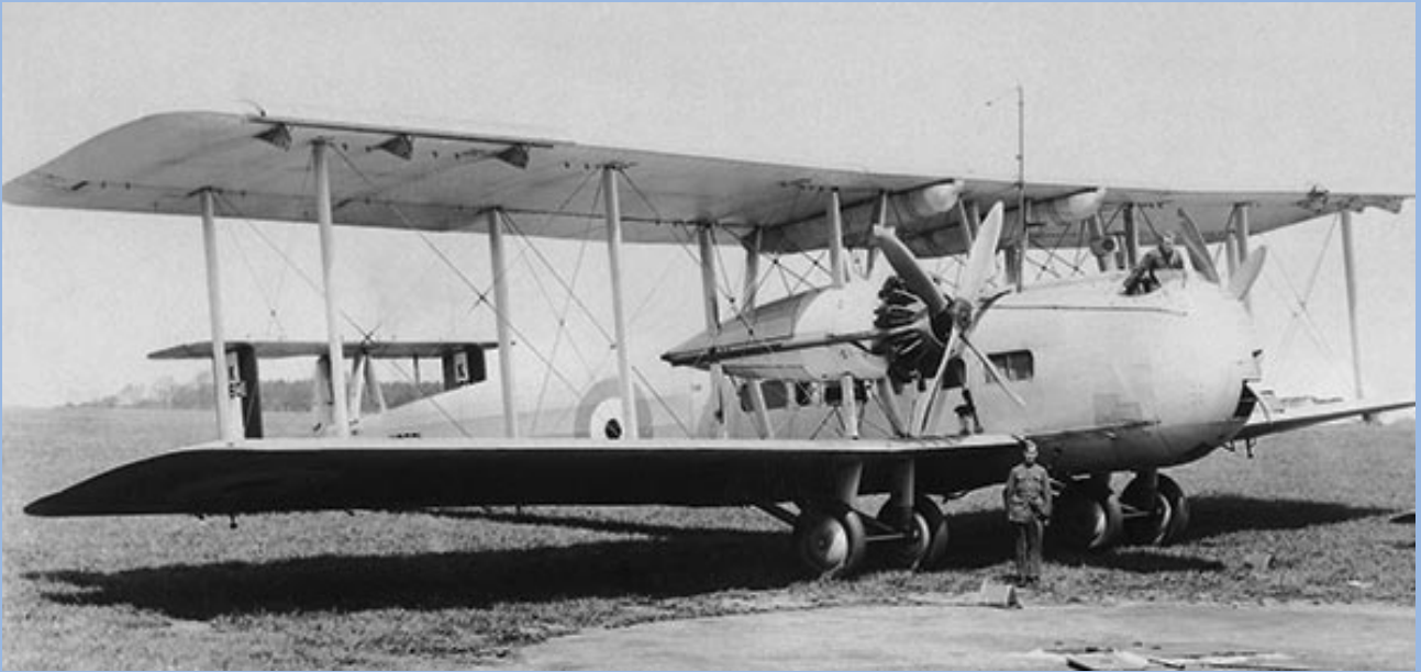
Vickers Valencia with open cockpit, carried a stick of 10 men.

situation which, had it continued, would have necessitated the commitment of many British troops to remain in India, thus preventing them from stopping the Japanese advance from Burma into India.