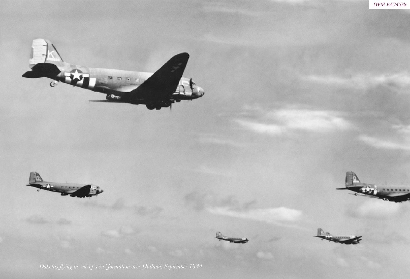
Dakotas flying in 'vic of vees' formation over Holland, September 1944