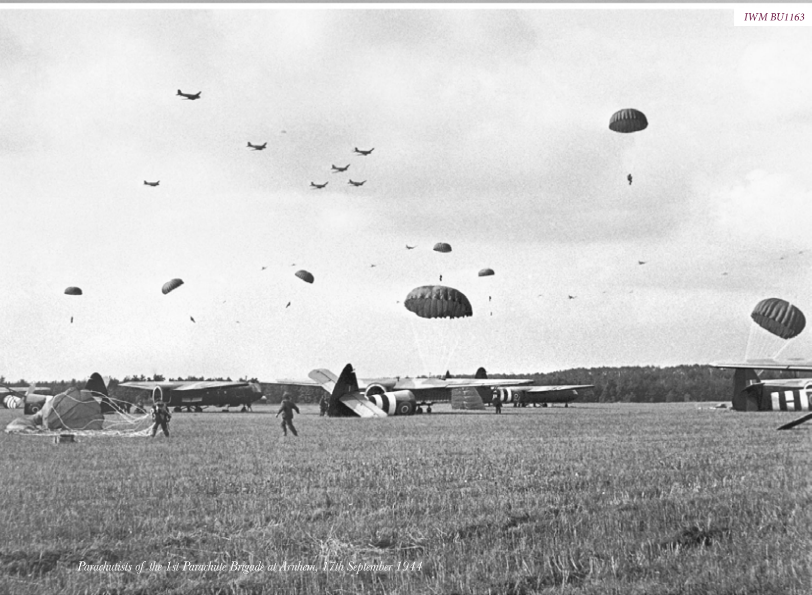
Parachutists of the 1st Parachute Brigade at Arnhem, 17th September 1944