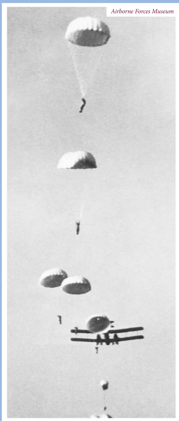
151 Battalion stick of 10, jumping from the Valencia, Delhi, 1941