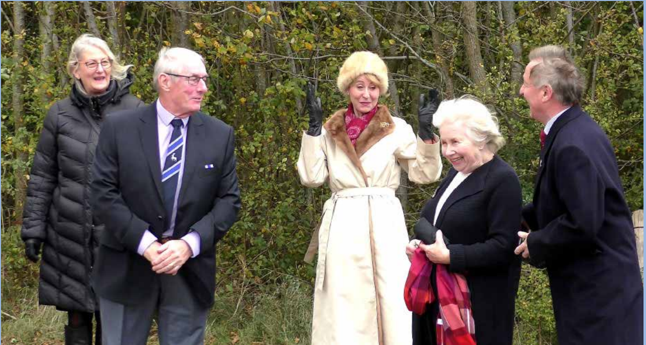
The hurricane-like conditions at Saltby Airfield create a moment of high amusement.