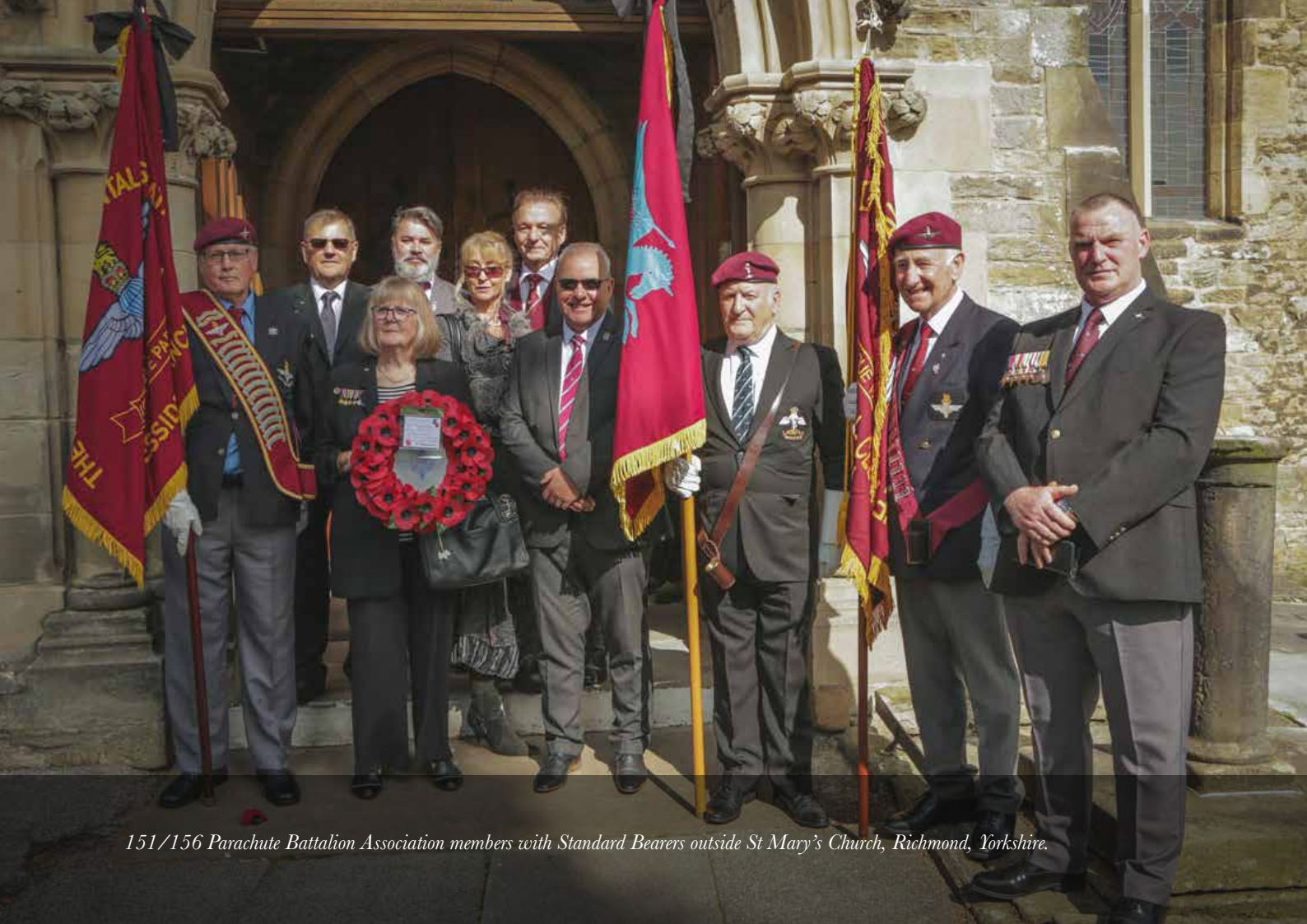
151/156 Parachute Battalion Association members with Standard Bearers outside St Mary's Church, Richmond, Yorkshire.