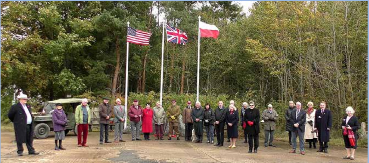
151/156 Parachute Battalion Association present at Saltby Airfield Memorial.