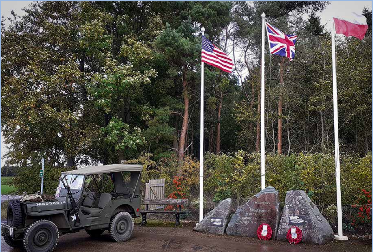
Wreaths from the 156 Parachute Battalion Association and the Leicester PRA next to the Saltby Memorial. The small garden behind the Monument is well cared for by members of the Glider Club.